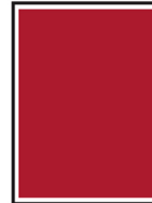
FULL PAGE 7"W X 11"H