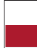
HALF PAGE 7"W X 5.5"H